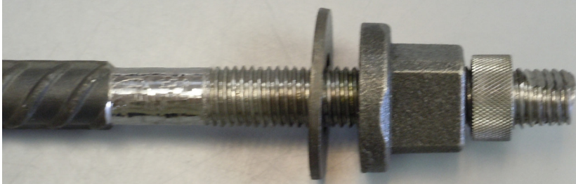
#6 Rebar with 3/4 Flange Nut, Stop Nut and 2" Washer